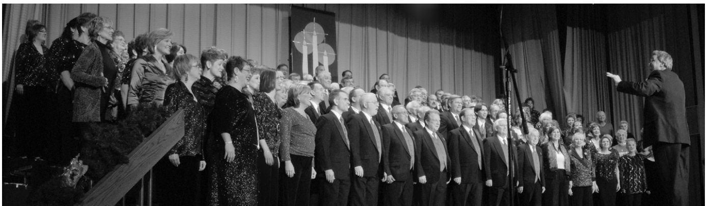
The Annual 2008 Holiday Show featured a stellar collection of music makers including the Heart of America Chorus, 5 The Kansas City Chapter of Sweet Adelines, and crowd-pleasing quartets!