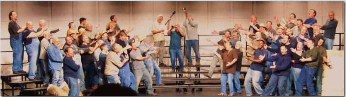
Above: Basin Street Blues - "... the band's there to meet us, old friends to greet us ..."